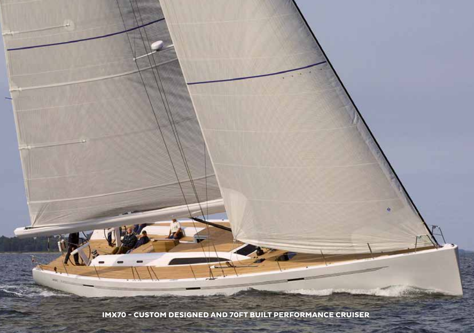
IMX70 - CUSTOM DESIGNED AND 70FT BUILT PERFORMANCE CRUISER