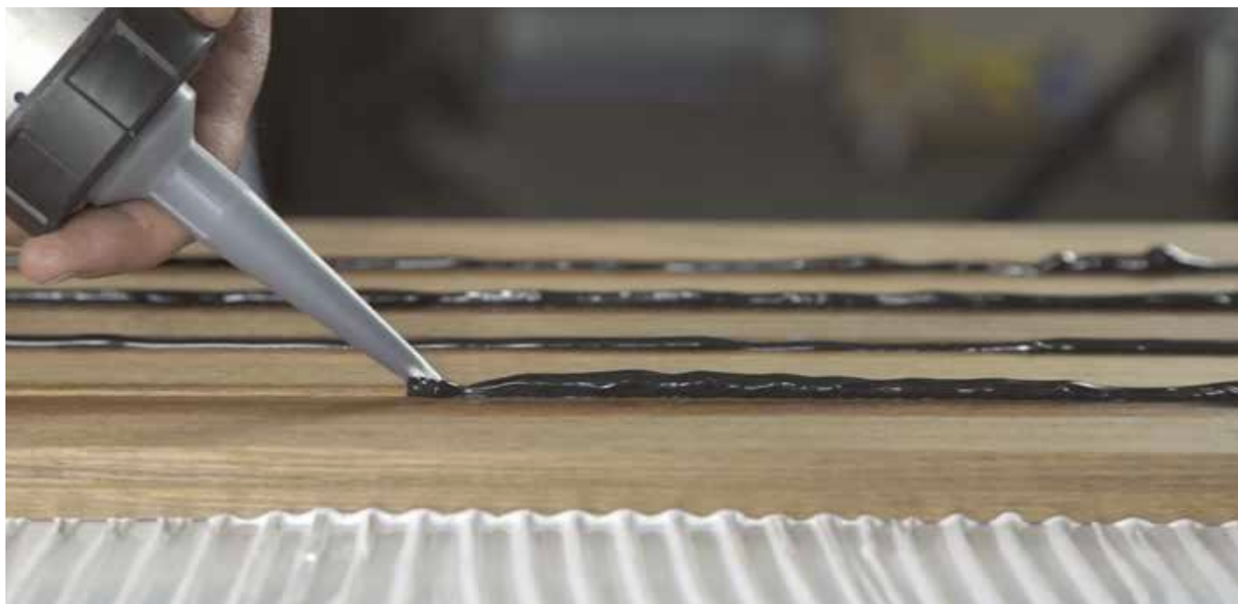
...THE INSTRUCTIONS ARE FOLLOWED PROPERLY