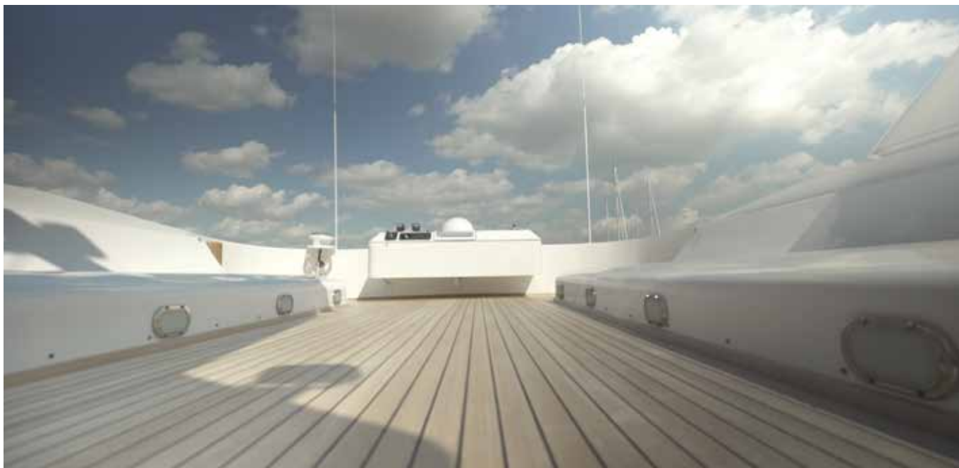
A PERFECT DURABLE TEAK DECK WILL BE OBTAINED IF...

Usually, no treatment is necessary or recommended after the sanding operation. For optical reasons, after-treatment is being applied more and more. No recommendation can be given on this matter, because of the large number of available lacquer and varnish systems. We advise a thorough investigation before applying any after-treatment. Never apply such a treatment before the deck caulk has cured completely. In general, lacquer and varnish systems affect the elasticity of the seams (consult Bostik). Consult Bostik for further information.